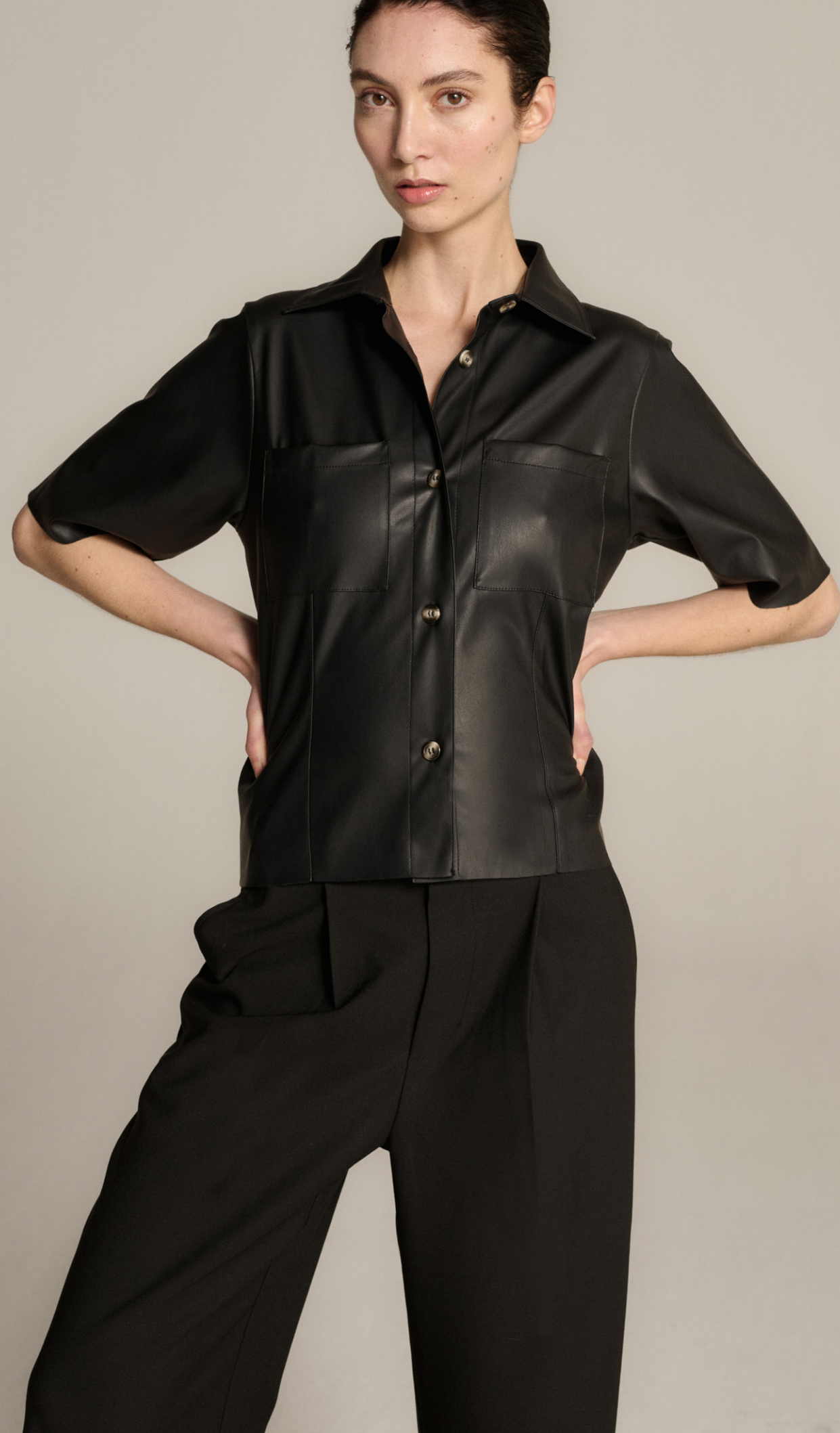
VONYA TOP - DOYA PANTS