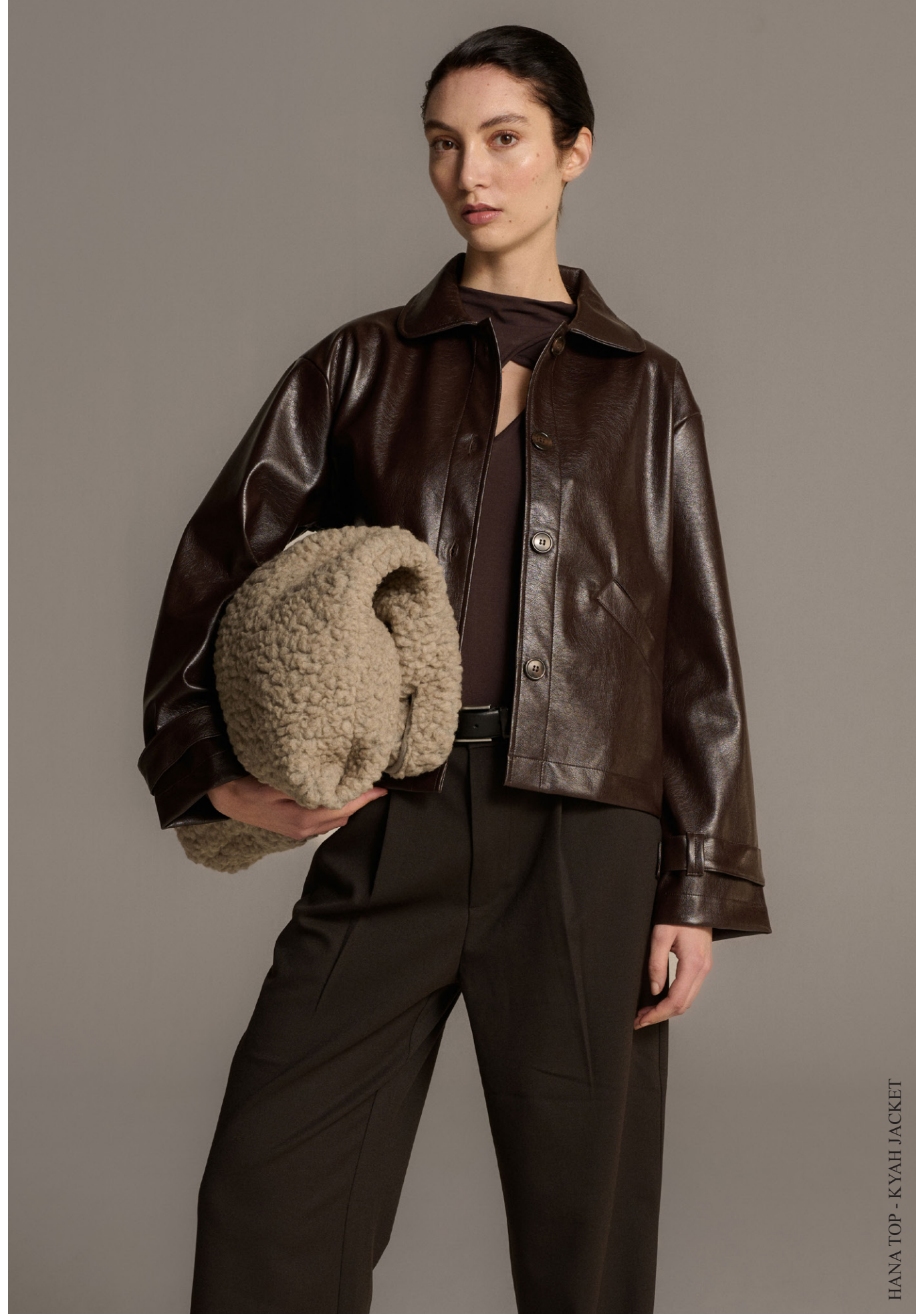
HANA TOP - KYAH JACKET