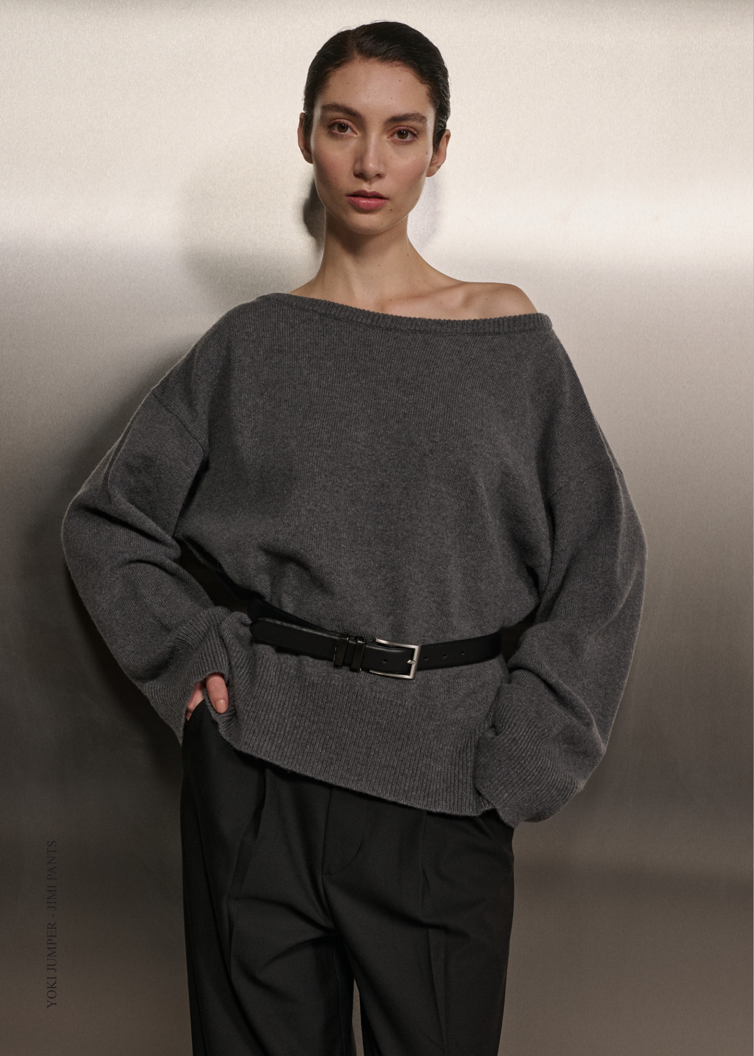
YOKI JUMPER - JIMI PANTS