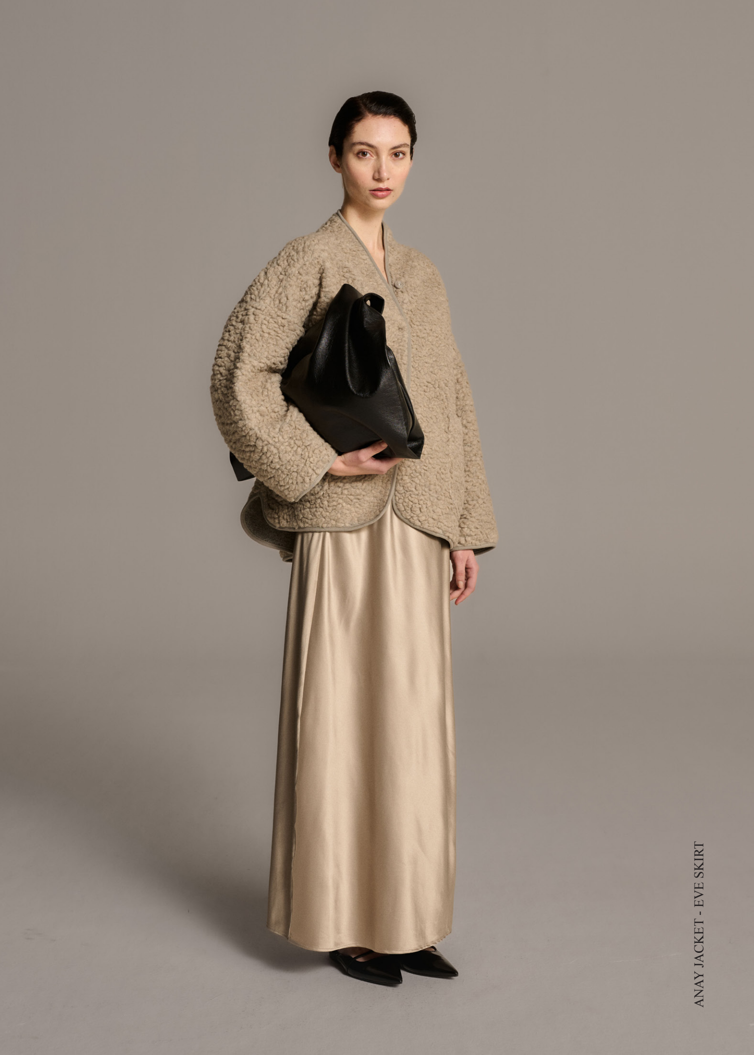
ANAY JACKET - EVE SKIRT