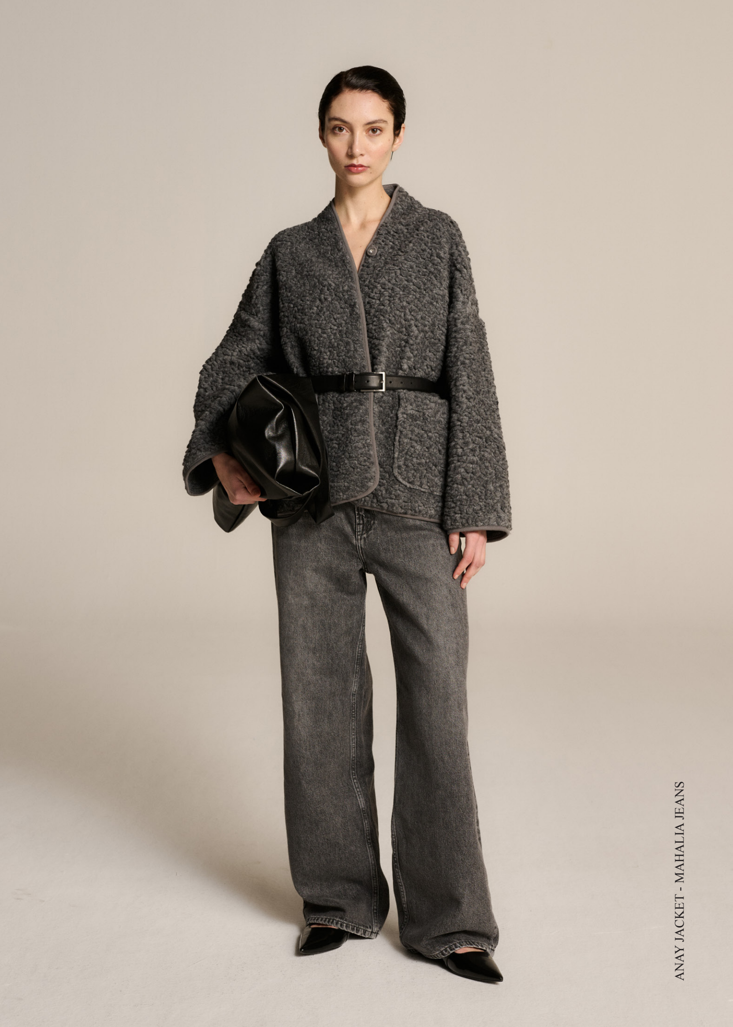
ANAY JACKET - MAHALIA JEANS