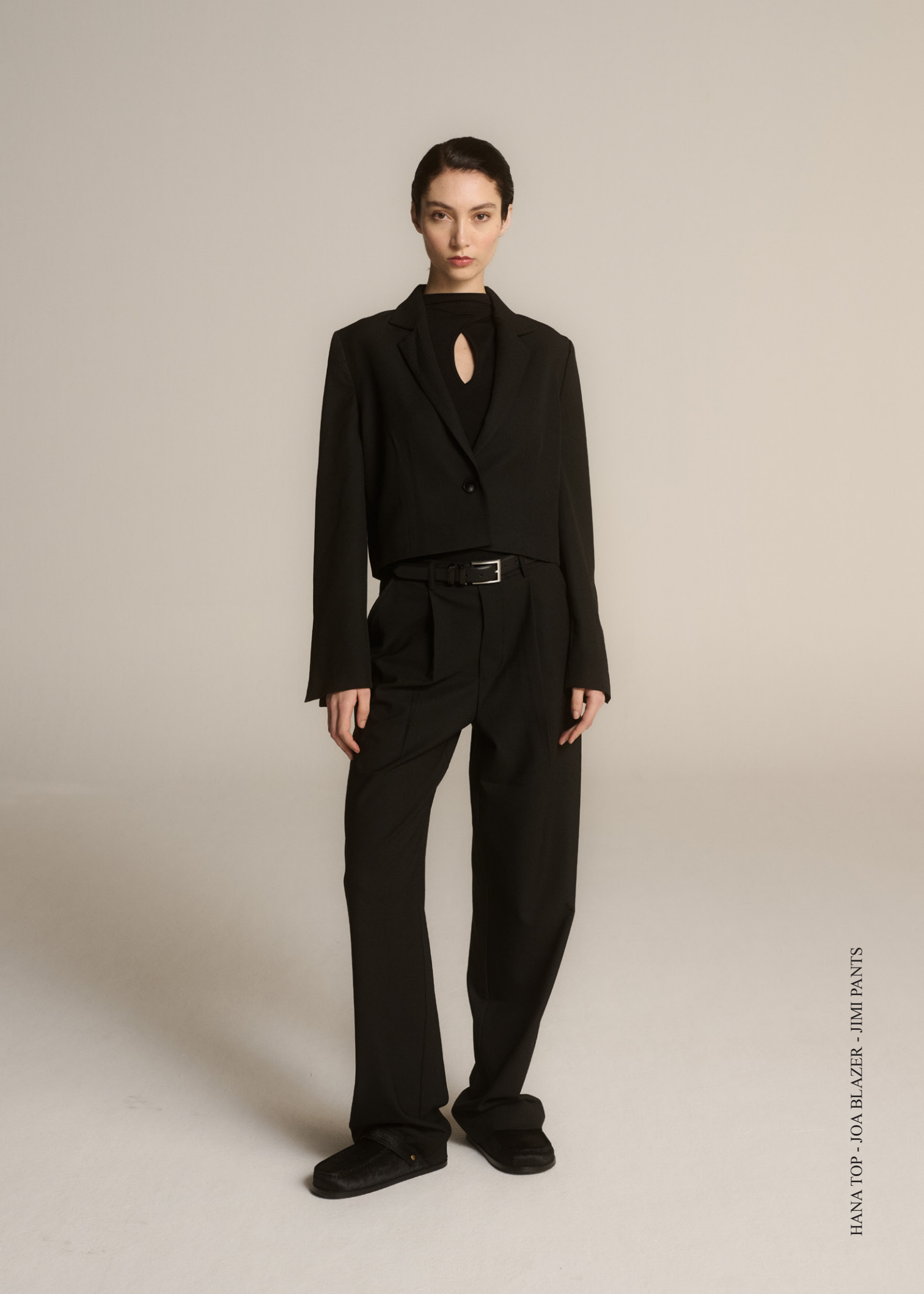
HANA TOP - JOA BLAZER - JIMI PANTS