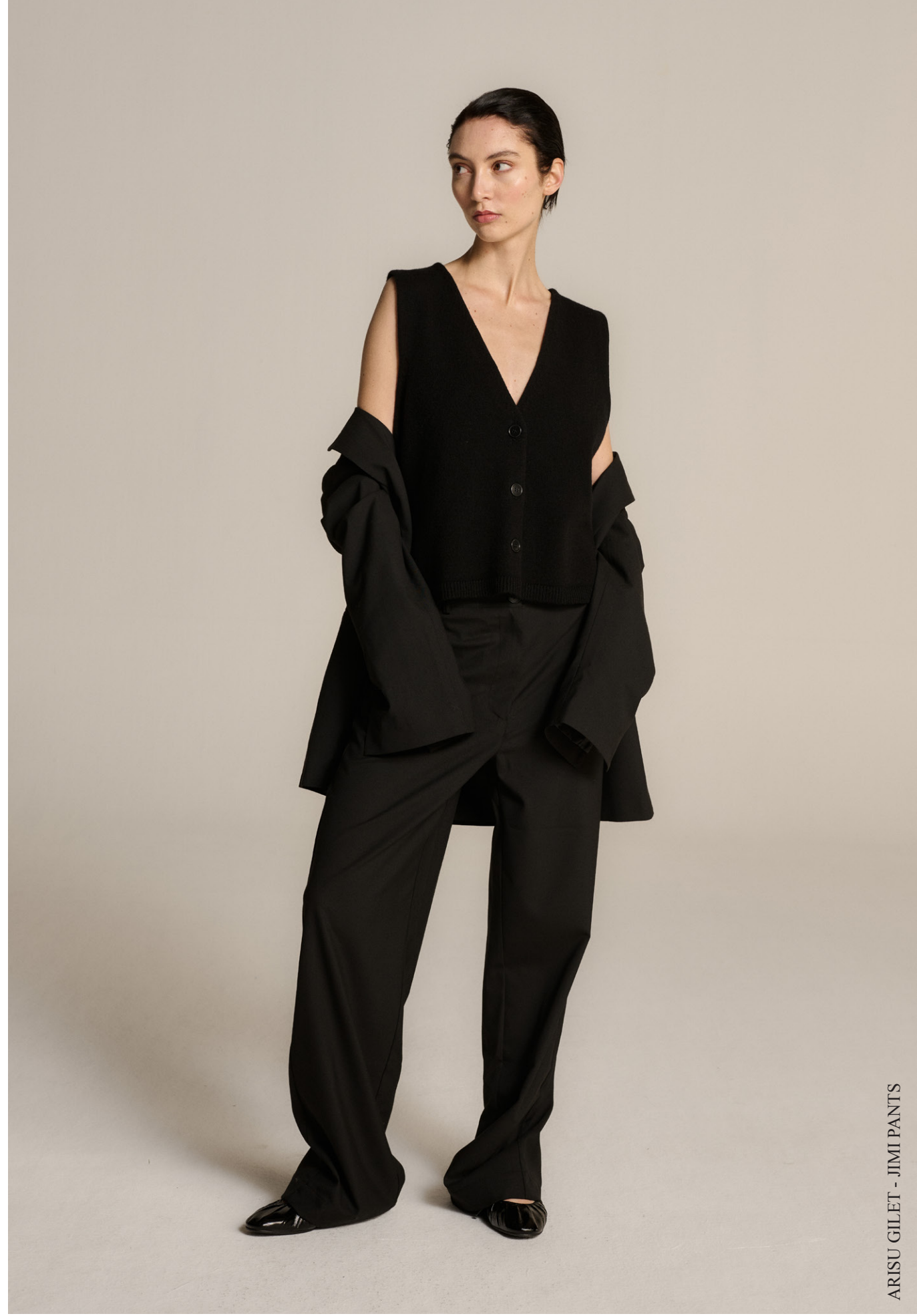
ARISU GILET - JIMI PANTS