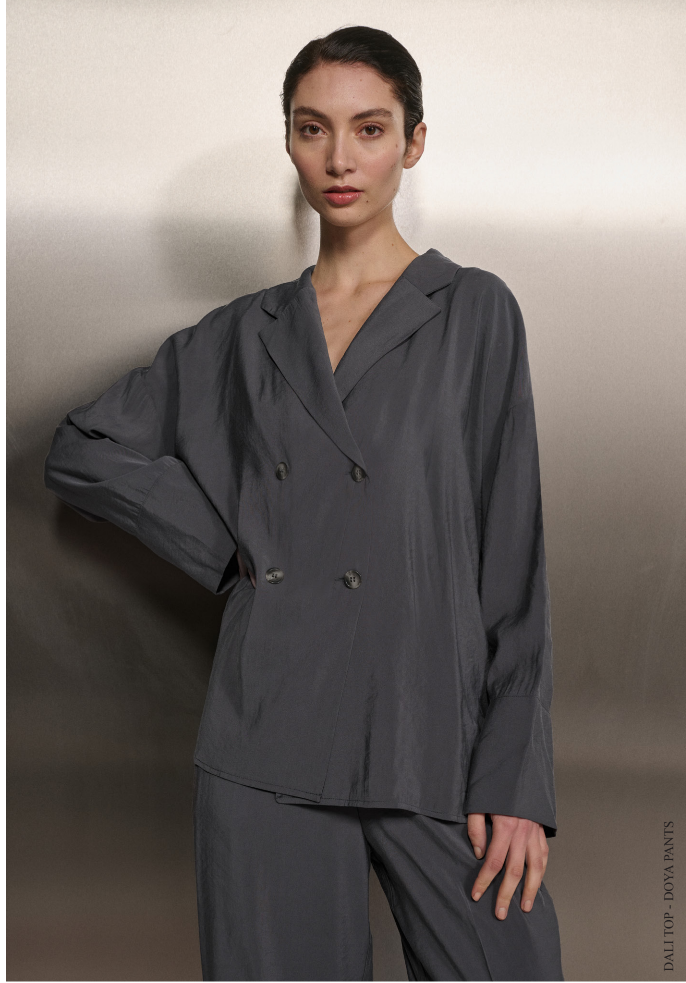
DALI TOP - DOYA PANTS