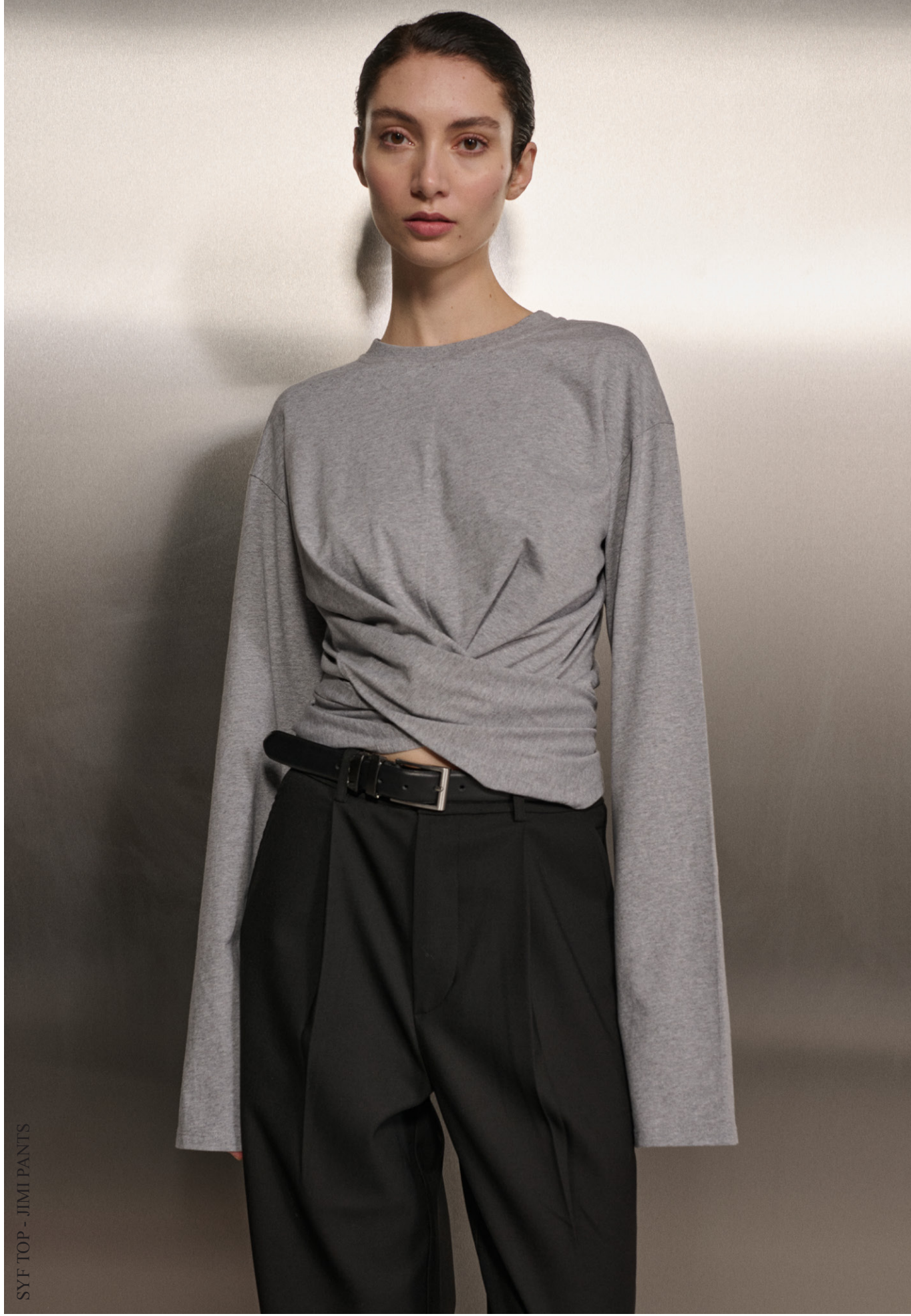
SYF TOP - JIMI PANTS