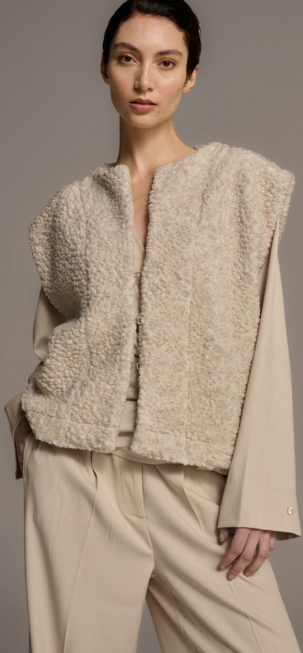
AYAKA WAISTCOAT - MANA PANTS