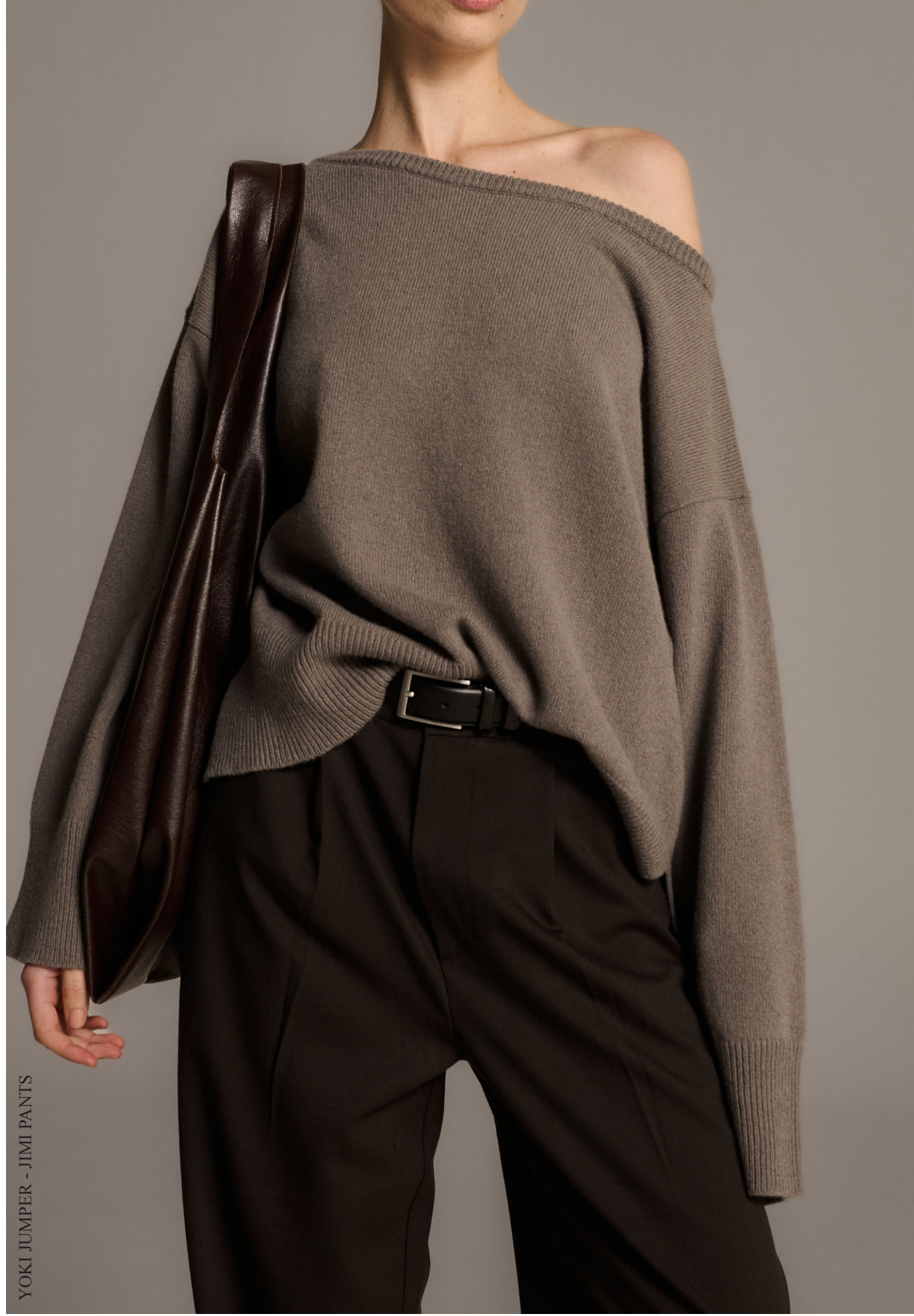
YOKI JUMPER - JIMI PANTS