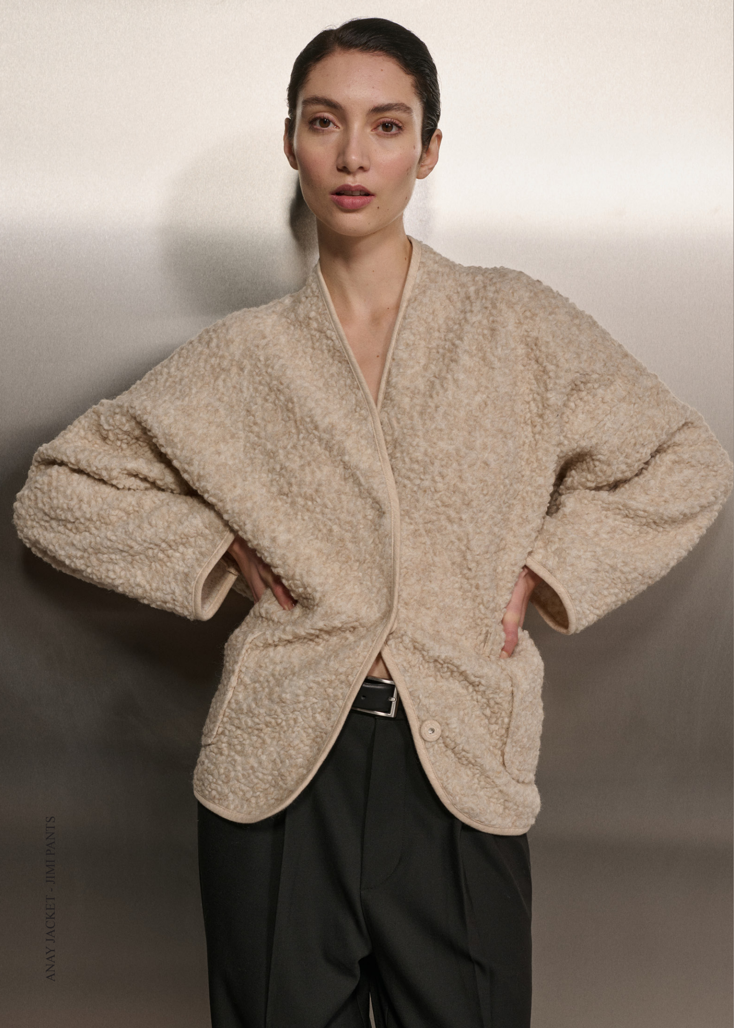
ANAY JACKET - JIMI PANTS