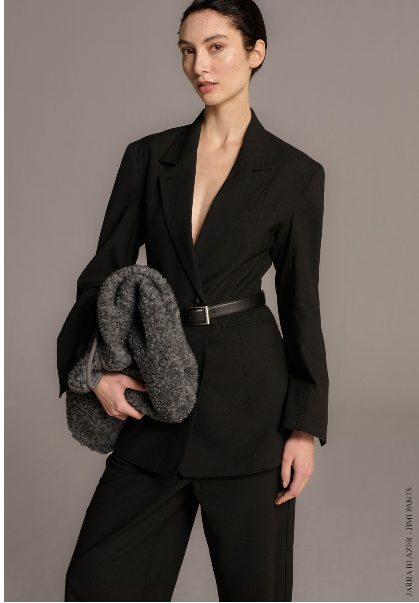
JARRA BLAZER - JIMI PANTS