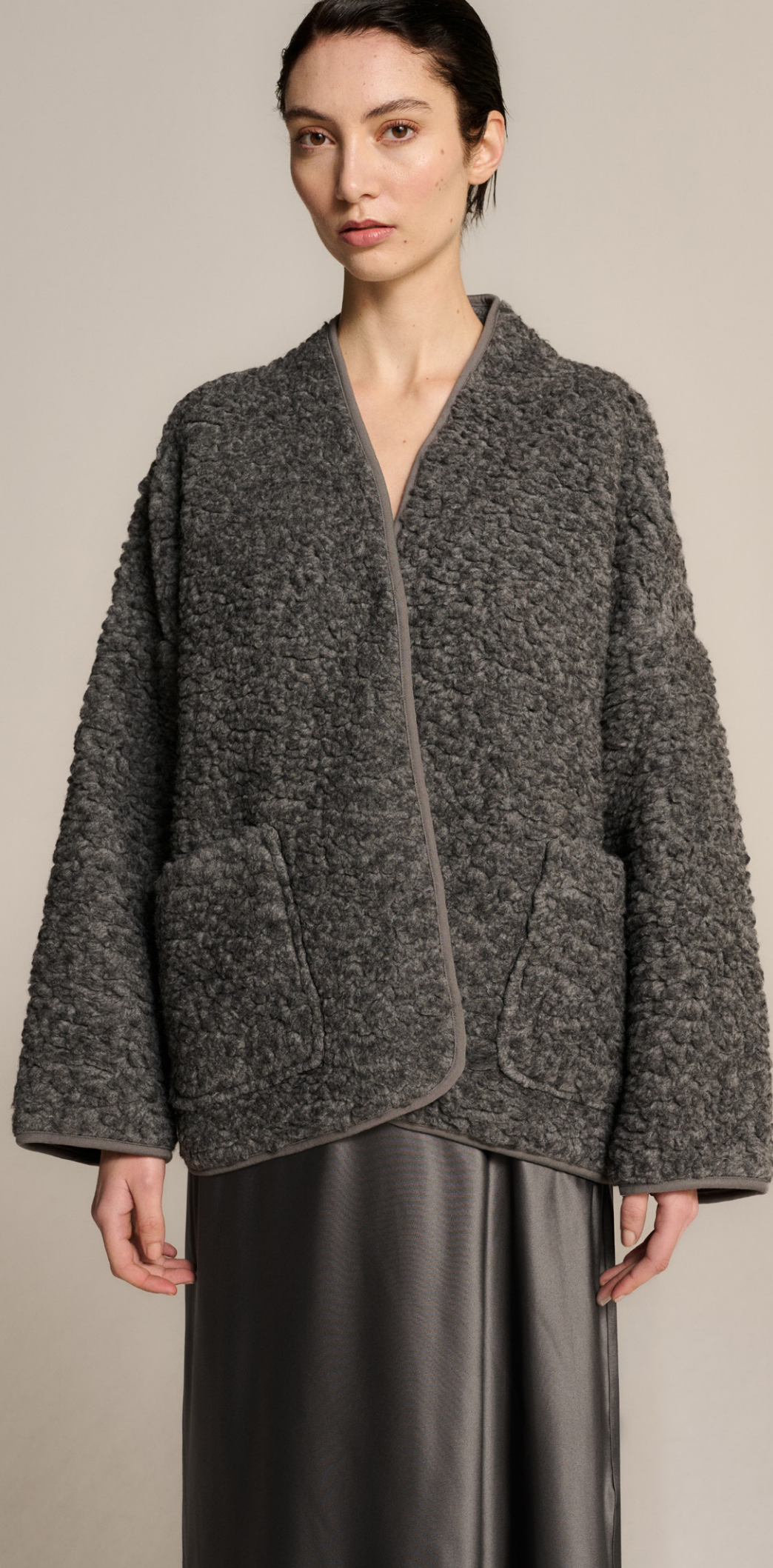
ANAY JACKET - EVE SKIRT