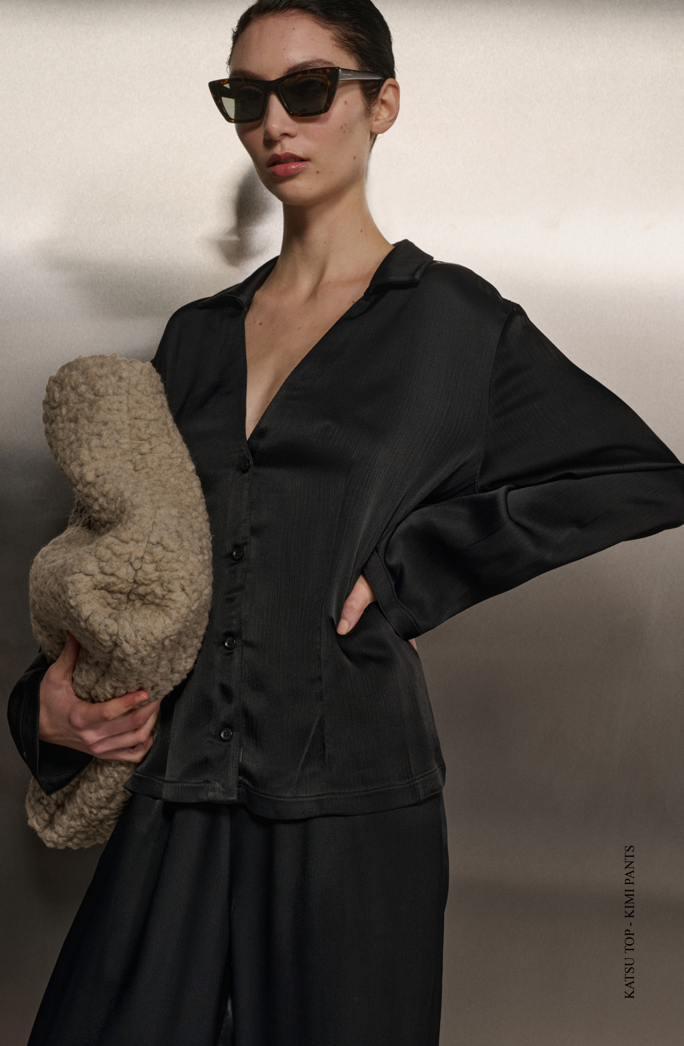
KATSU TOP - KIMI PANTS