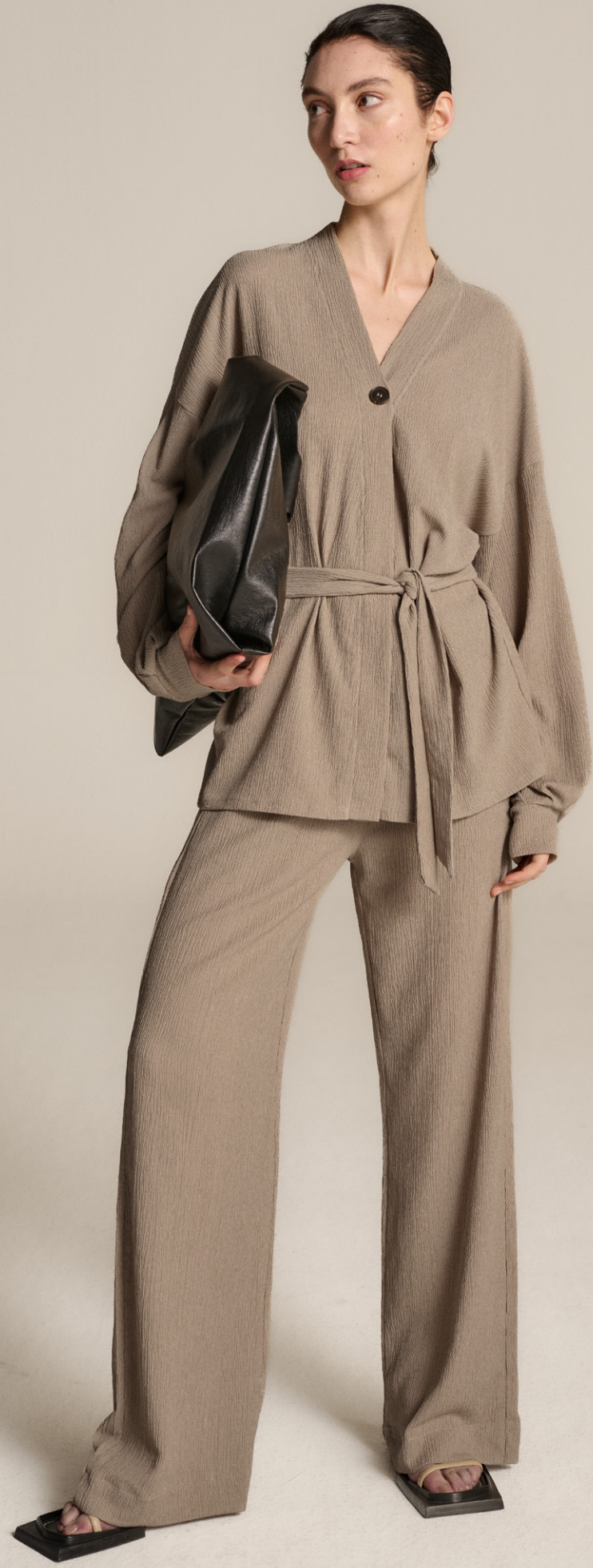
ROMO TOP - RYLA PANTS